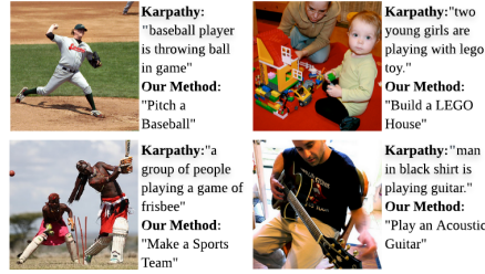
Figure 2: Description Comparisons

For a qualitative analysis, we conducted two crowdsourced studies on Amazon Mechanical Turk. For the first study, over 13 judges answer 10-randomly picked images along with image descriptions generated by NeuralTalk2(Karpathy and Fei-Fei ), im2txt(Vinyals and Toshev