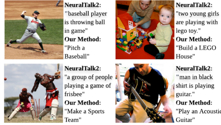
Figure 2: Description Comparisons

We conducted a crowd-sourced study on Amazon Mechanical Turk. In the study, workers answer 10-randomly picked images along with image descriptions generated by NeuralTalk2, im2txt(Vinyals and Toshev 2015), multi-label classifier (Szegedy et al. 2017) (as baselines) and our